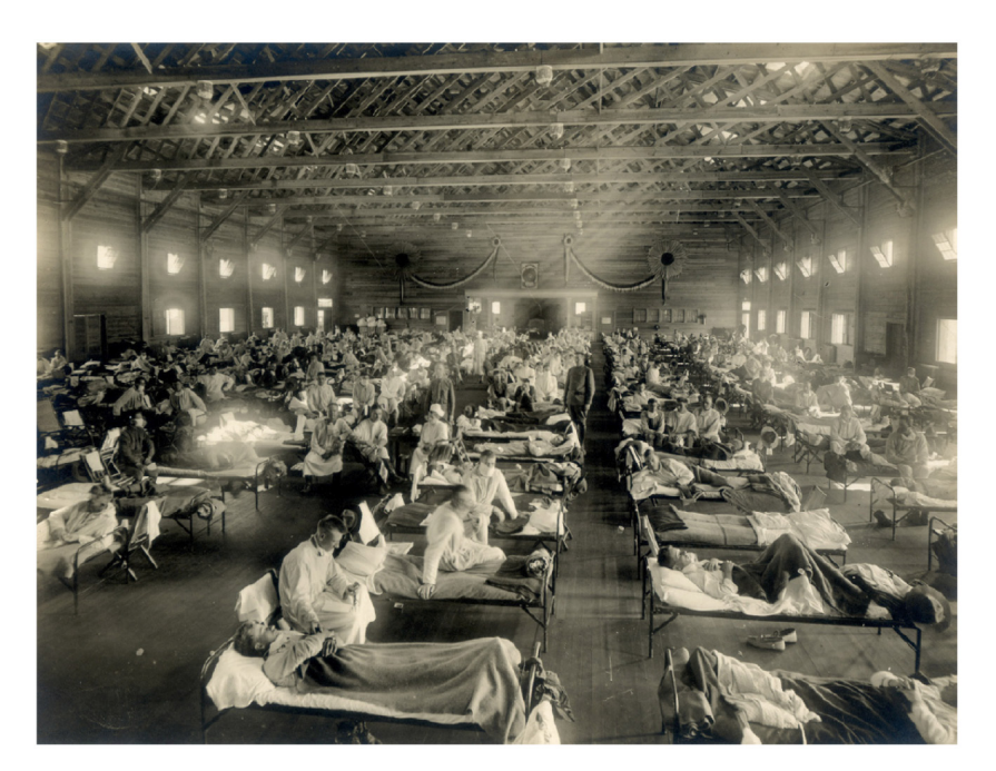
Figure 3. Camp Funston, Ks., emergency hospital during 1918 influenza epidemic.

described until decades after the pandemic, were noted in about half of autopsies.<sup>17</sup>