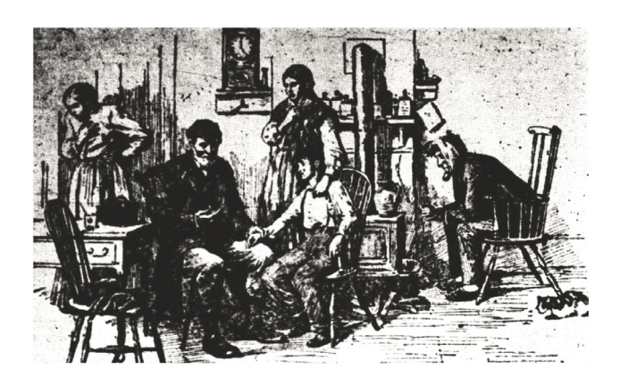
Figure 5. "We've got that durned influenzy agin" by A.B. Frost, Kansas City Star, November 27, 1918