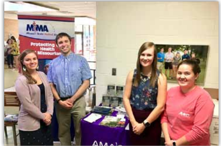
Awesome work from the officers of the Medical Student Sections recruiting many first-year students as members of MSMA at University of Missouri - Columbia School of Medicine (left), and A.T. Still Kirksville College of Osteopathic Medicine (right).