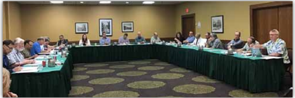
MSMA's Legislative Committee met as part of the Council Meeting in July. Thank you to the MSMA members who took the time to continue working for their profession and their patients.

During the July 2019 Council Meeting in Osage Beach, Missouri, MSMA voted to support a campaign for the November 2020 ballot initiative regarding Medicaid expansion. Currently, a proposed statute and a proposed Constitutional amendment, both with the same language, have been filed with the Secretary of State. MSMA support would be given to whichever option emerges as viable. The Council also approved supporting Missouri Hospital Association's subcontract with Iowa Healthcare Collaborative for the CMS Clinician Quality Improvement Collaboration.