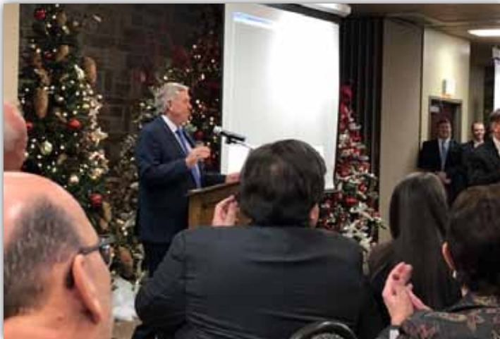
Governor Mike Parson hosted a Rural Healthcare Summit in Bolivar, bringing together MSMA and other stakeholder and industry leaders to identify working solutions to address the challenges and unmet healthcare needs in rural Missouri.