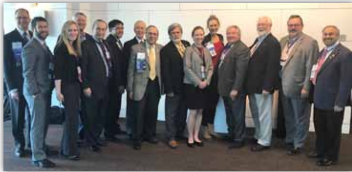
The Missouri Delegate to the American Medical Association Interim Meeting in San Diego, California, November 15-16, 2020.

A resolution from the 2018 MSMA Annual Convention has resulted in the American Medical Association (AMA) modifying its policy H-295.924 “Future Directions for Socioeconomic Education.” The resolution asks for AMA to encourage LCME to ensure accreditation includes socioeconomic subjects in the medical curriculum. More details can be found on the AMA’s Policy Finder website after it is updated for the actions from the recent AMA meeting.