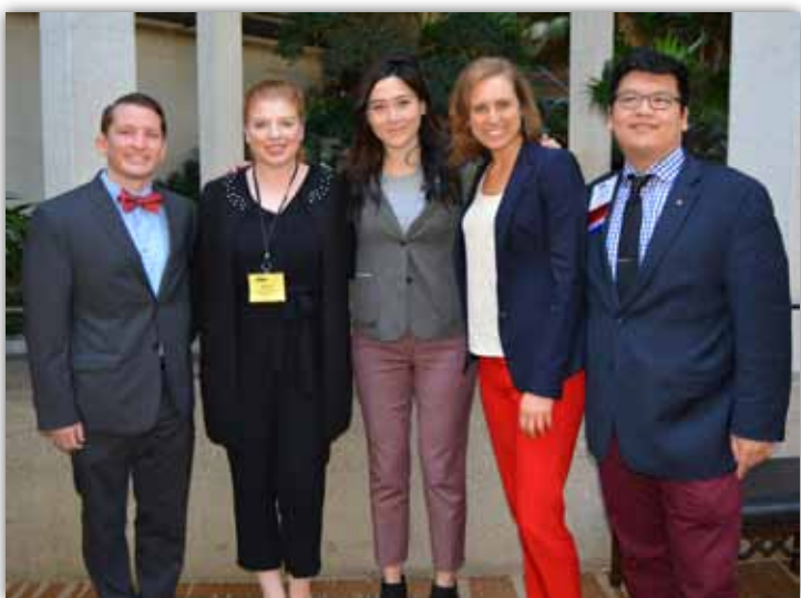
The MSMA Resident and Fellow Section introduced a resolution creating a Women Physicians Section within the MSMA. Review the new section guidelines at www.msma.org/msma-constitution-bylaws .