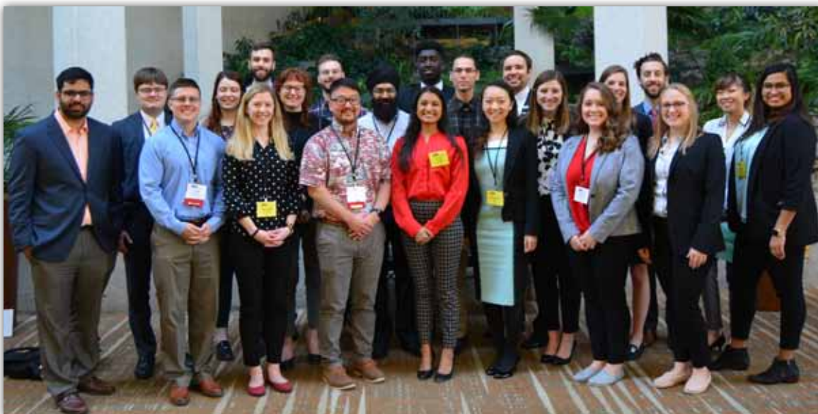
The MSMA Medical Student Section was well represented by six schools of medicine from around the state: A.T. Still University Kirksville College of Osteopathic Medicine, Kansas City University, Saint Louis University, University of Missouri -Columbia, University of Missouri - Kansas City, and Washington University.